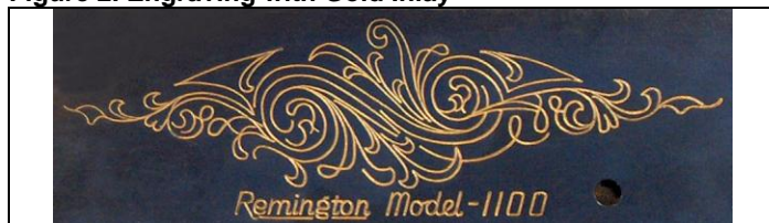
Figure 2. Engraving with Gold Inlay